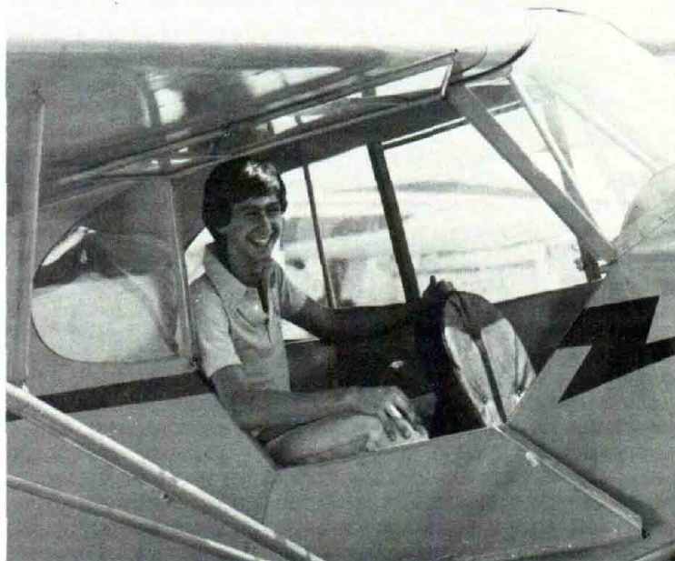
From a Mustang to a J-3 . . . instead of the other, traditional, way around.