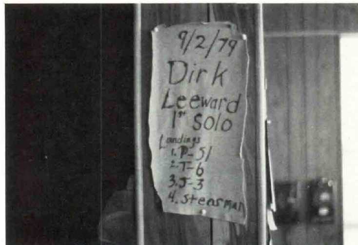
The shirt tail says it all.