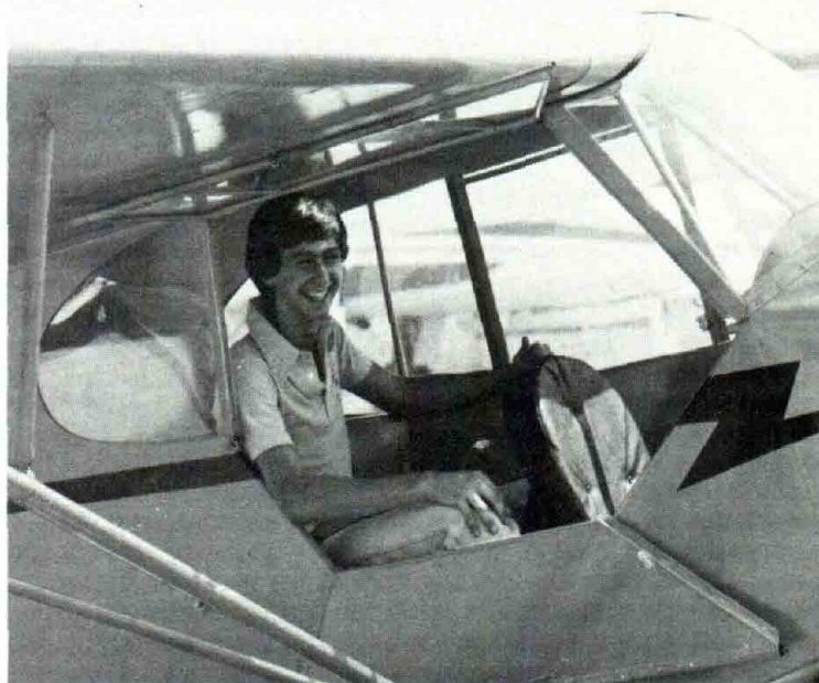
From a Mustang to a J-3 . . . instead of the other, traditional, way around.