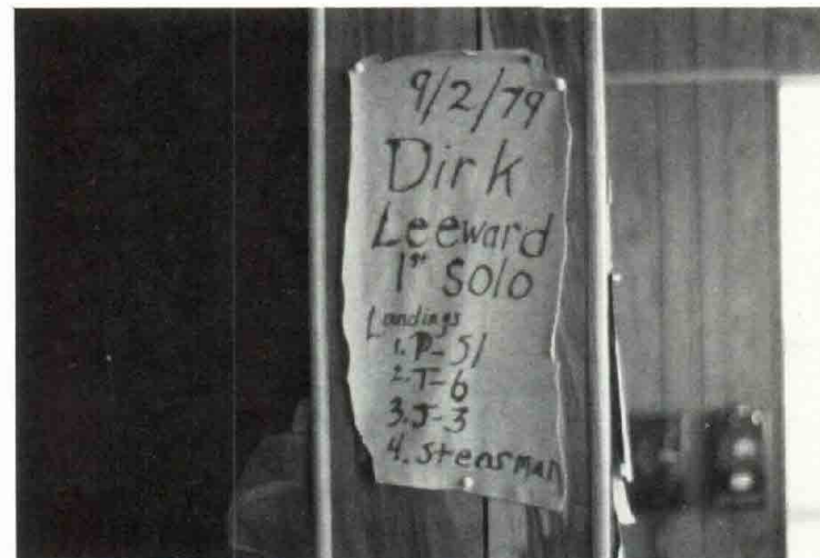
The shirt tail says it all.