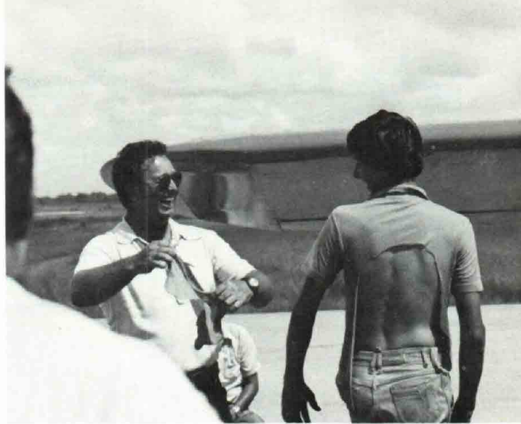
. . . a shirt tail trimming!